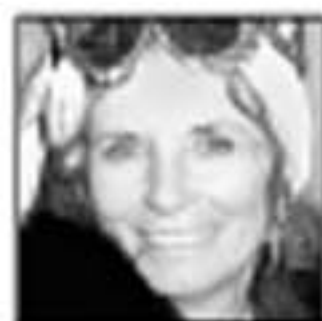
June Carter Cash

46. "Live Like You Were Dyin'," Tim McGraw