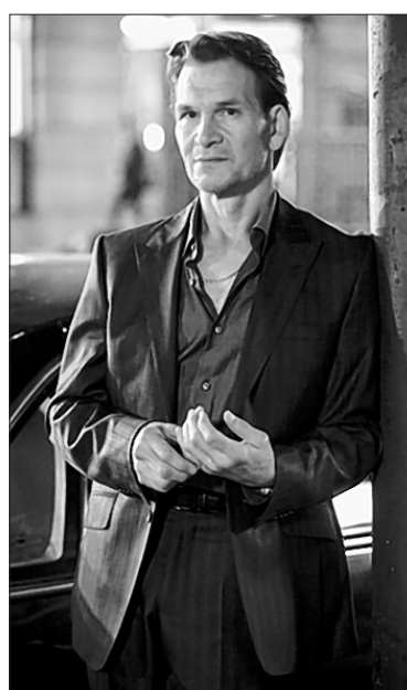
Walter Cronkite, whose legendary career in broadcasting earned him the moniker of the nation's most trusted man, died in July.