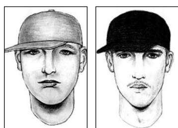
Sketches of the two suspects

One threatened to harm her and forced her to drive to an abandoned building at Spencer and Western Avenue. He de-